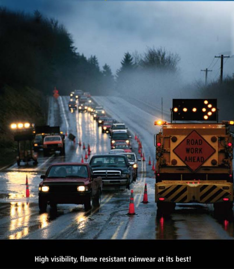
High visibility, flame resistant rainwear at its best!