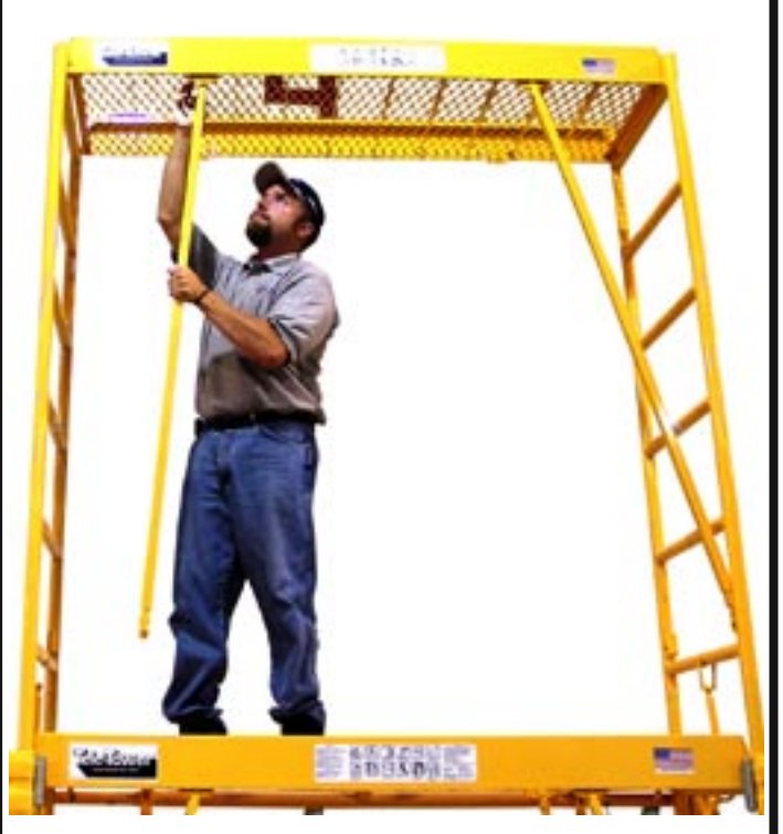
Attach all four braces before using. (2 of 4 braces shown here.)