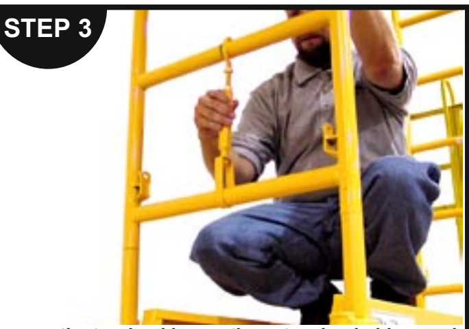
Loosen the turnbuckles on the extension ladders and turn them down toward the deck.