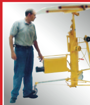
Raise as normal.

*The 195 works with the 138-2 (pictured right) and the 460 (pictured above). The loaders will only load the standard lift and do not work with the extensions. The 138-2 reaches 11' and the 460 reaches 15' standard.