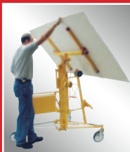
Board tilts back.