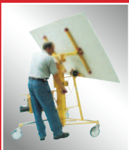
Raise the board.